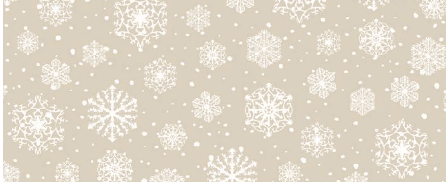
F24306-12 | Snowflakes | Beige