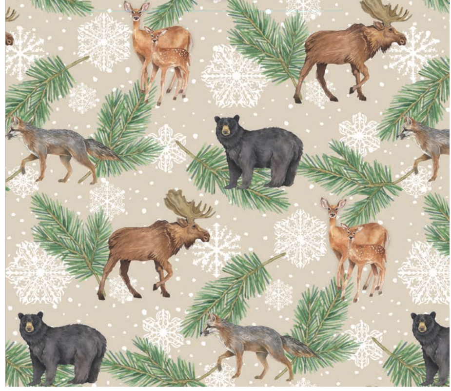
F24301-12 | Animal Coordinate | Beige Multi