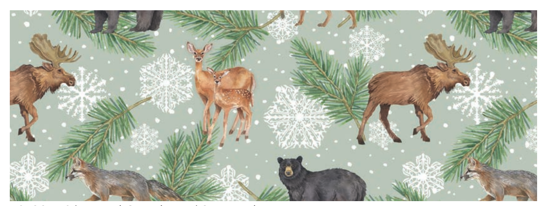
F24301-72 | Animal Coordinate | Sage Multi